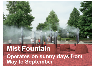
Mist Fountain Operates on sunny days from May to September

Opened: April 1, 2002 Area: 114,608.43m 2 (as of April 2019)