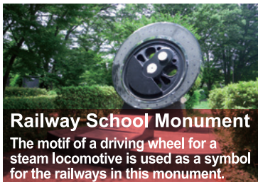
Railway School Monument The motif of a driving wheel for a steam locomotive is used as a symbol for the railways in this monument.