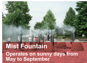
Mist Fountain Operates on sunny days from May to September