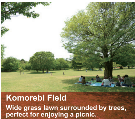
Komorebi Field Wide grass lawn surrounded by trees, perfect for enjoying a picnic.