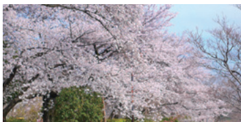
Cherry blossoms Late March to early April