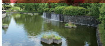
Musashi no Ike Pond Contains Ogi no Taki Waterfalls. Kingfishers and spotbilled ducks visit the water areas.