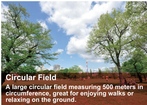
Circular Field A large circular field measuring 500 meters in circumference, great for enjoying walks or relaxing on the ground.