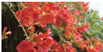
Chinese trumpet vine July to September